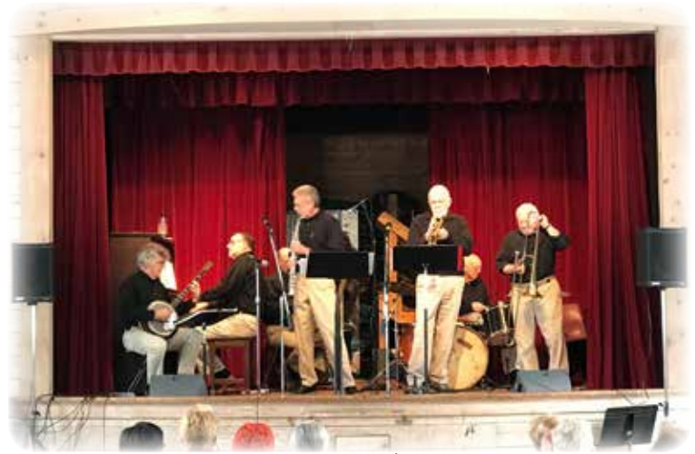
The Sharecare/Senior Services Variety Show