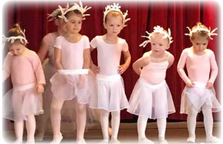
Dance With Joy Recital