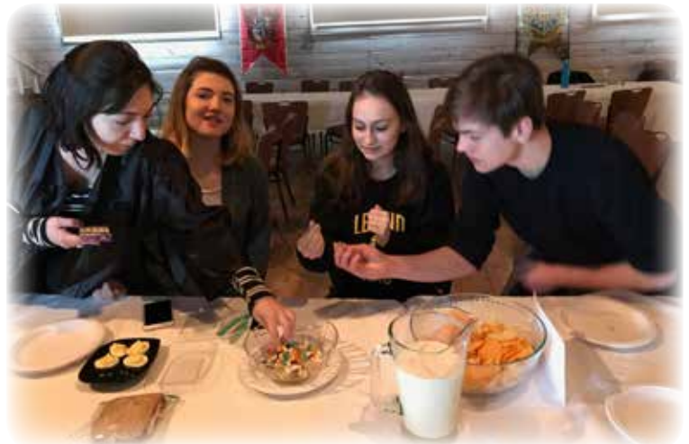
Harry Potter Movie Marathon