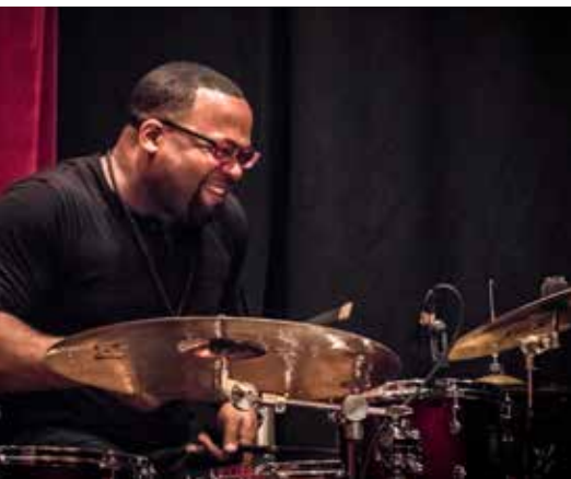
B Williams

The B Williams Experiment takes the stage with their Detroit Jazz. The Old Art Building will be transformed into a comfortable club and the jazz will drift through the air. Tickets $20