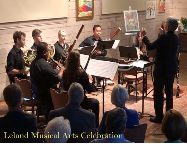
Leland Musical Arts Celebration