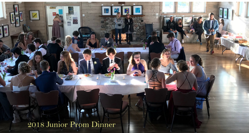
2018 Junior Prom Dinner