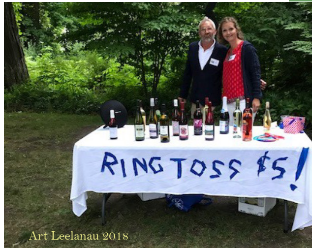
Art Leelanau 2018