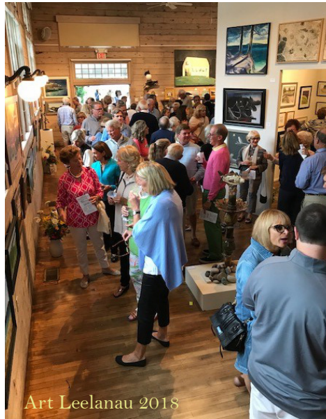
Art Leelanau 2018