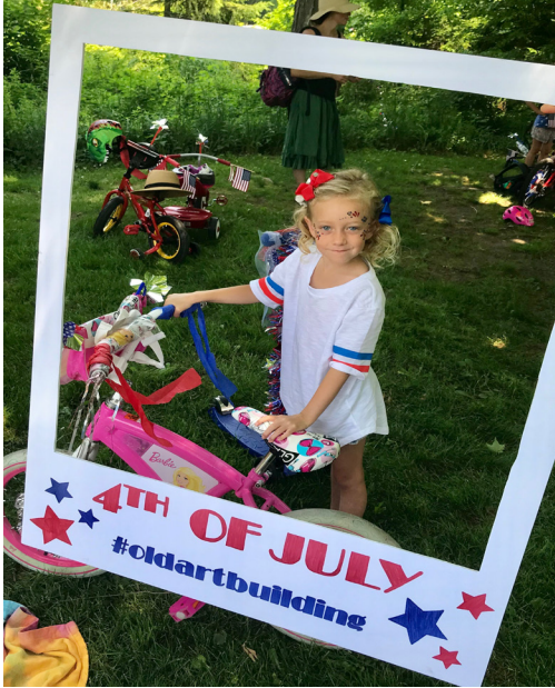
4th of July bike parade