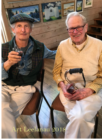
Art Leelanau 2018