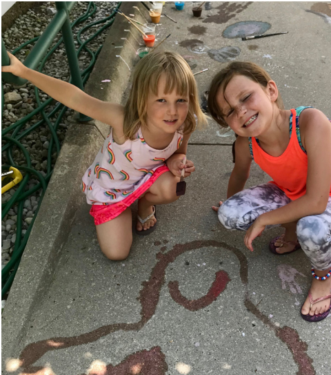
Little Bird School of Music