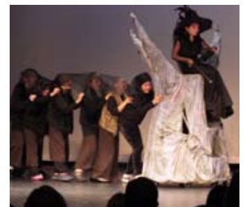
Sleeping Beauty performance