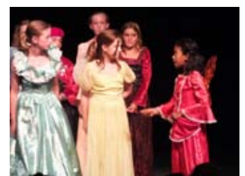
Sleeping Beauty scene