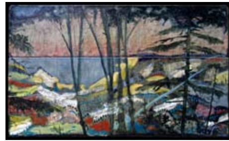
Last Day of the Ice Age, Oil & Paper on Wood, 24x40

His summer schedule at the Old Art Building will feature an exhibit on June 22-24 and a two-day mixed media workshop titled "Pitch it, Sketch It, Make It", intended to challenge participants "to make that piece that has been stewing for a while but just hasn't been able to get out."