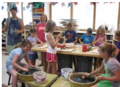
Fun with Ceramics