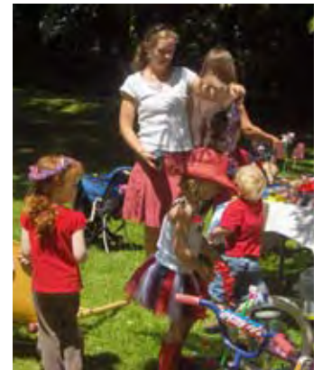
Bike decorating on July 4