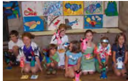
Birds of a Feather