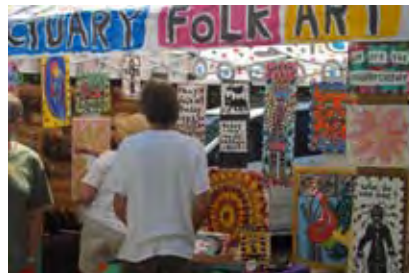
Artists' Market booth