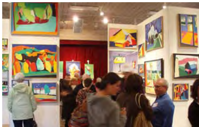
Right: Exhibit features wide body of work.